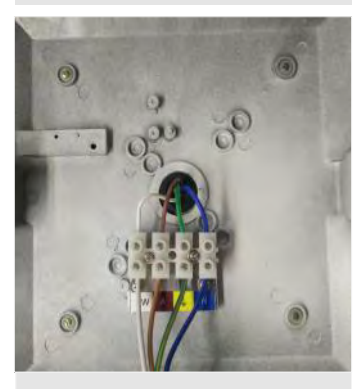
7. Connect Switched Active into SW terminal, Permanent Active into A terminal.