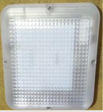
10. Screw diffuser back onto the base by tightening the 4 Philips screws.