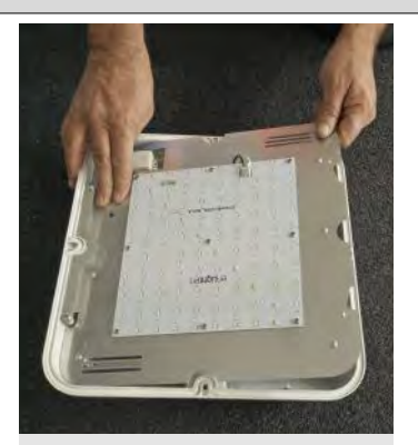
3. Push gear tray down opposite the swivel clips to take gear tray out.