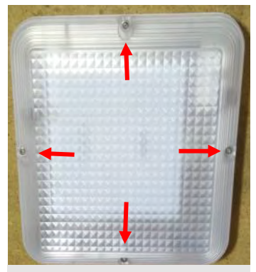
1. Unscrew the 4 Philips screws and remove diffuser.

Light must be operated within its specified operating parameters and in accordance with our warranty requirements. These documents are available on our website.