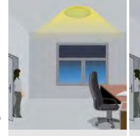
The light switches to 100% when motion is detected.