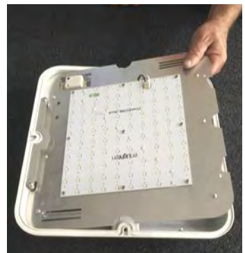
9. Hook gear tray under metal bar and swivel locks to secure the gear tray.