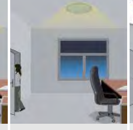
After the hold time the light switches to standby mode. If twilight time is set to infinity the light remains in standby mode and does not turn off.