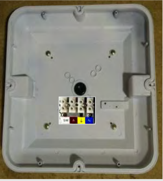
4. Mount base to the ceiling using 5mm x 25mm nail-ins. If IP65 rating is required use cable gland & side entry on the side opposite the LED driver.