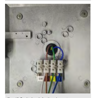
7a. If Switched Active is not available, connect white and brown cable to the Permanent Active.