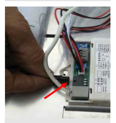
8. Plug battery plug into driver and note date of commissioning on battery.