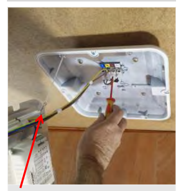
6. Use hook provided to suspend gear tray from base and connect gear tray wiring (see next images).