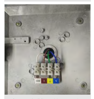
5. Connect building wiring to mains terminal.