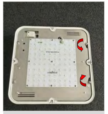
2. Swivel clips to unlock gear tray.