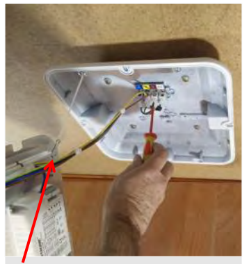
6. Use hook provided to suspend gear tray from base.