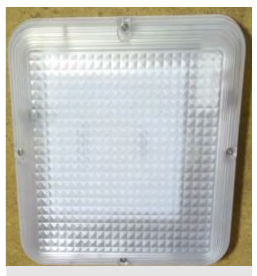
10. Screw diffuser back onto the base by tightening the 4 Phillips screws.