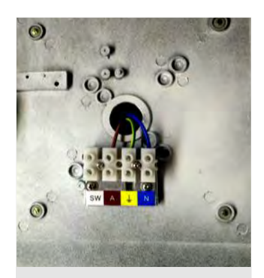
5. Connect building wiring to mains terminal.