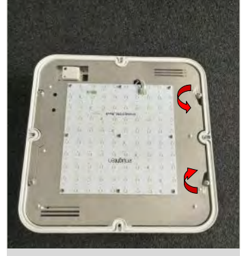
2. Swivel clips to unlock gear tray.