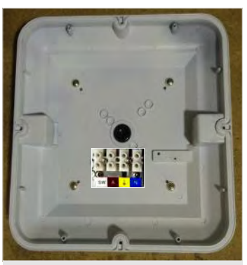
4. Mount base to the ceiling using 5mm x 25mm nail-ins. If IP65 rating is required use cable gland & side entry on the side opposite the LED driver.