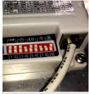
8. Adjust settings of the microwave sensor if required (see over page).