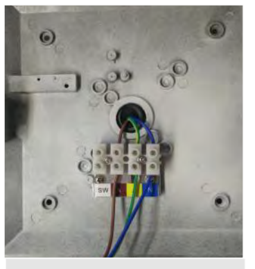
7. Connect wire loom from gear tray into the terminal block.