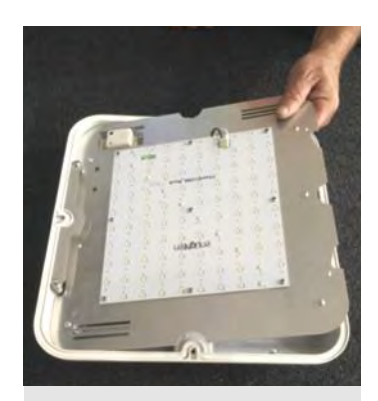
9. Hook gear tray under metal bar and swivel locks to secure the gear tray.