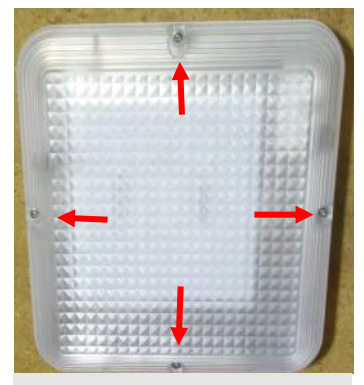
1. Unscrew the 4 Philips screws and remove diffuser.

NOTE: All electrical work must be carried out by a licensed electrician as per the latest AS 3000 wiring regulations. Do not touch LEDs during installation or maintenance or put gear tray facing downwards onto surface. Warranty void if LED damage found. Light must be operated within its specified operating parameters and in accordance with our warranty requirements. These documents are available on our website.