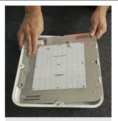
3. Push gear tray down opposite the swivel clips to take gear tray out.