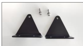
Surface mount brackets